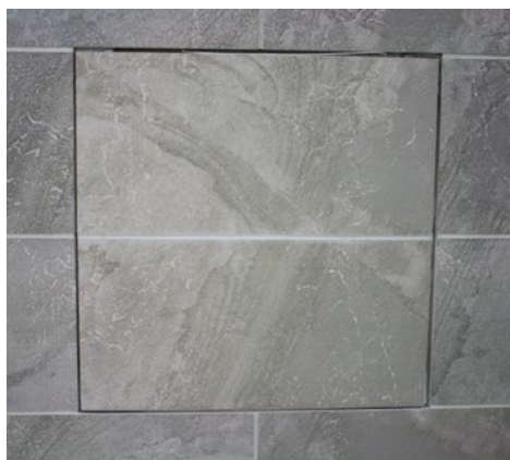
Without ventilation grille