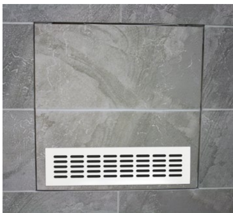
Ventilation grille in white