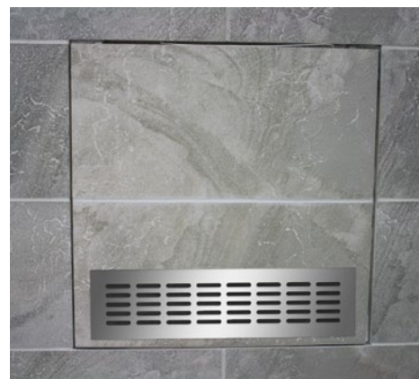
Ventilation grille in aluminum

The inspection panel from KOLLER is an excellent choice! It is frameless and invisible, making it ideal for inspection openings in tiled walls, whether for whirlpools, bathtubs or piping. With the integrated ventilation grille, it offers not only a practical solution for access, but also blends in harmoniously.