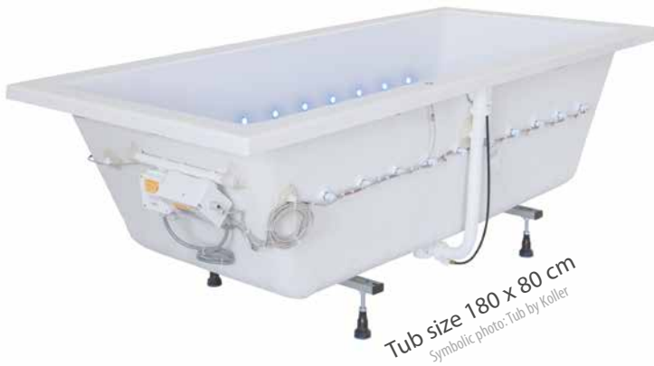
Tub size 180 x 80 cm Symbolic photo: Tub by Koller