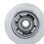
Midi Jets (Side)