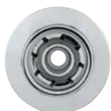
Midi Jets (Foot)

The system is switched on and off again with the Direct Line pushbutton switch. Starts, stops and regulates the blower, or switches the water system on and off.